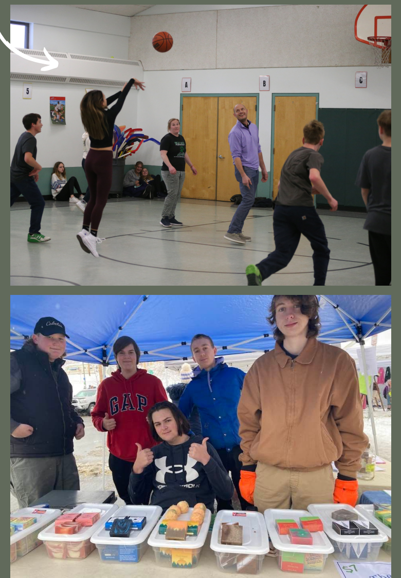
Cabot high schoolers selling the soap they made in chemistry class at the December Holiday Market in Cabot Village.