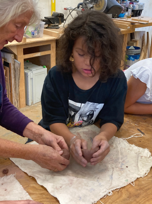
Clay making @ Cabot

Recently, while visiting a kindergarten classroom, we were chatting with some students who were drawing multimedia creations of castles and families. In the course of our visit one of the artists told a story about a dog in the picture that was hurt. Another artist at the table stopped their work and asked, "Is your dog ok?". This is an example of compassion; this child was sympathetic and then acted on their emotion to express caring for their classmate.