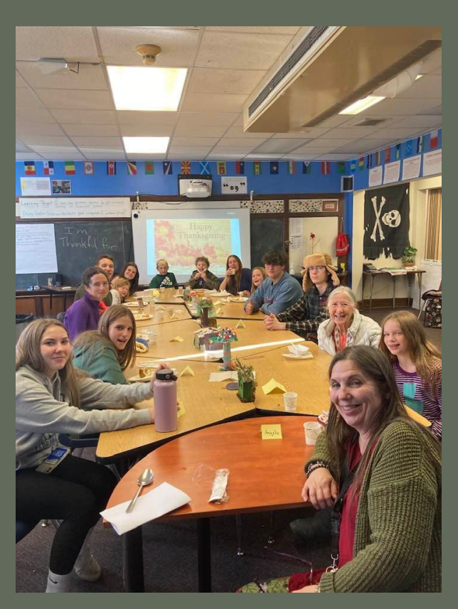
Cabot School students and staff enjoying a Harvest Meal together just before the Thanksgiving break.