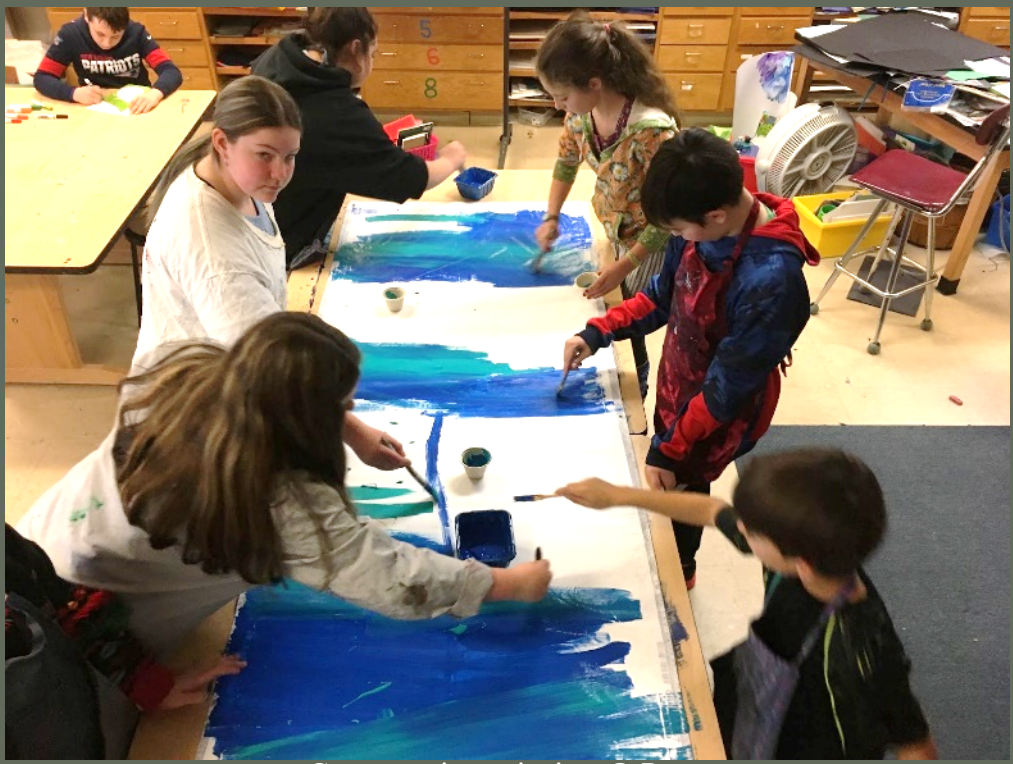
Community painting @ Barnet