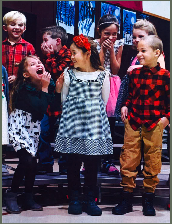
Holiday concert @ Barnet