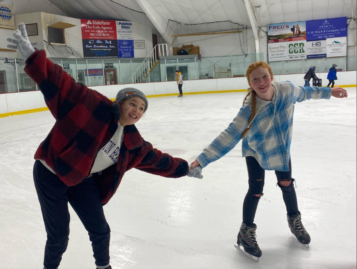
Winter wellness @Danville